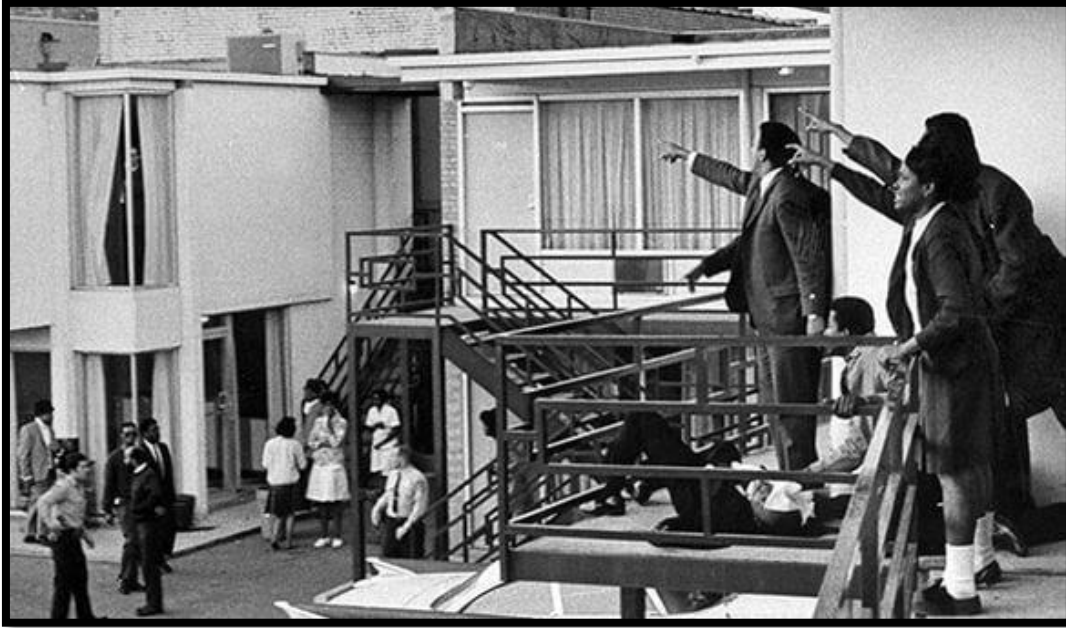
A mortally wounded Dr. King sprawled on the balcony of the Lorraine Motel as his aides point in the direction of the gunman.

"Everybody can be great, because everybody can serve. You don't have to have a college degree to serve. You don't have to make your subject and your verb agree to serve. You don't have to know about Plato and Aristotle to serve. You don't have to know Einstein's theory of relativity to serve. You don't have to know the second theory of thermodynamics in physics to serve. You only need a heart full of grace, a soul generated by love. And you can be that servant."